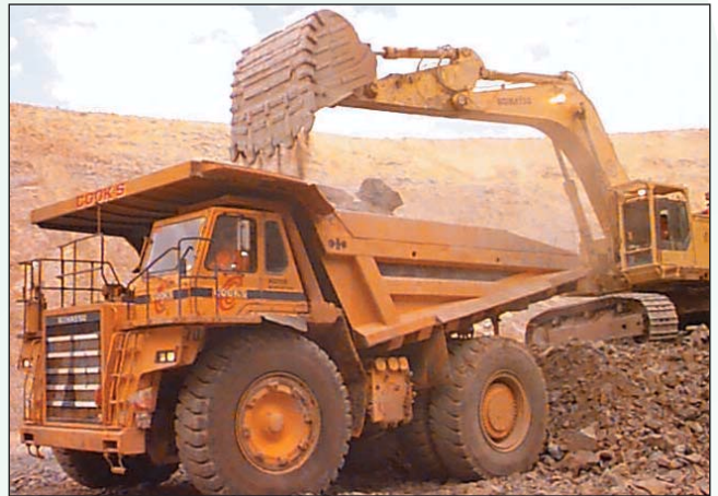
Komatsu 785-3 dump truck at the Kailis mine, WA

For many years the company has developed various policies and procedures for the required functions that have been necessary to support field activities. Some of these have turned into departments of their own eg. quality assurance and safety. This has been as a result of the growing importance of those departments as a