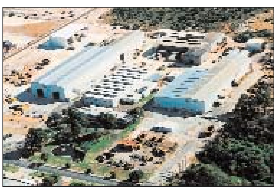
NS Komatsu Welshpool

NS Komatsu Western Region currently employs 233 personnel and of that number, 193 staff are centred around product and customer support. All staff